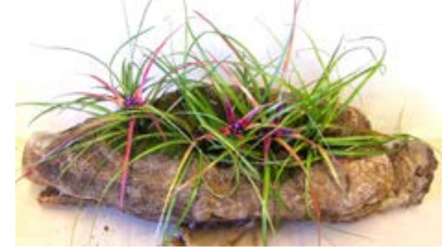
'Pretty Garden' by Keryn Simpson