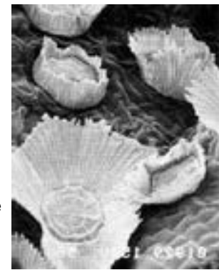
Tillandsia ionantha x200

Following treatment with amyl acetate, the specimens, in their holders, were placed in a critical point drying apparatus in which the amyl acetate was replaced by liquid carbon dioxide under high pressure. After the amyl acetate was completely replaced, the temperature was raised to the point at which the transition from liquid to gaseous carbon dioxide took place without stress-forming phase boundaries.