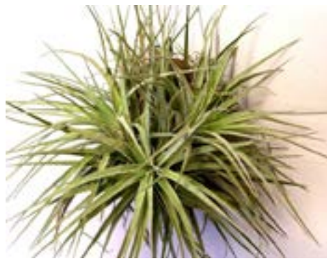
Tillandsia 'Cotton Candy' shown by Dave Boudier