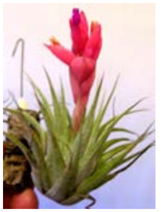
Tillandsia roseiflora shown by Ross Little