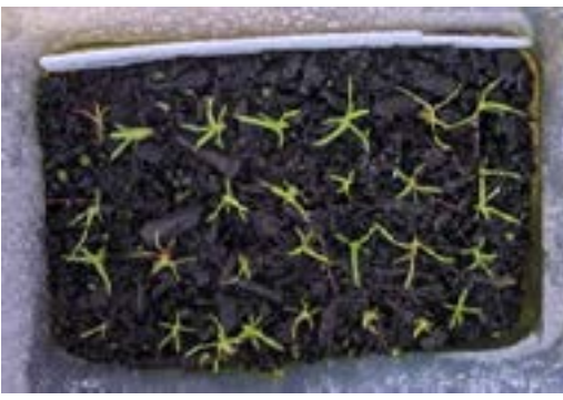
Green dots are germinating seed