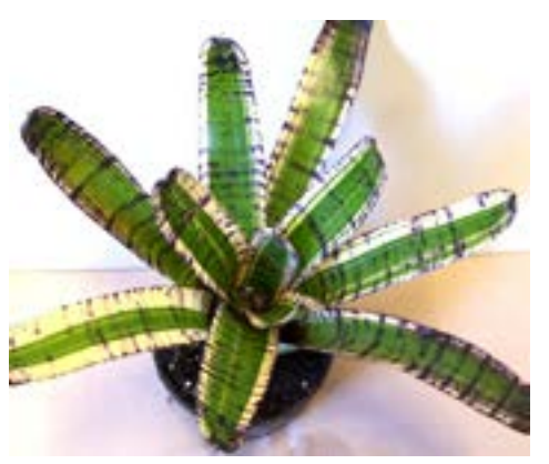
Neoregelia 'Banshee' shown by Keryn Simpson