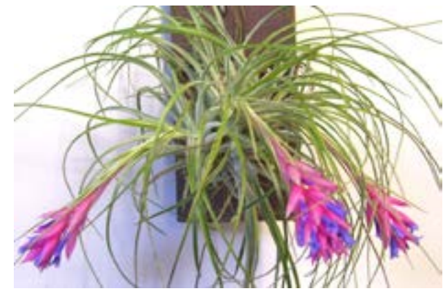
Tillandsia stricta shown by Gary McAteer