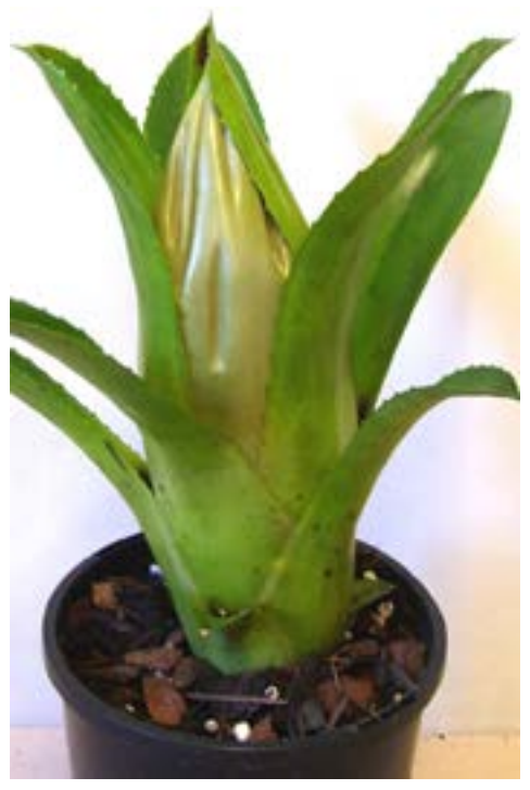
Aechmea brassicoides shown by Mitch Jones